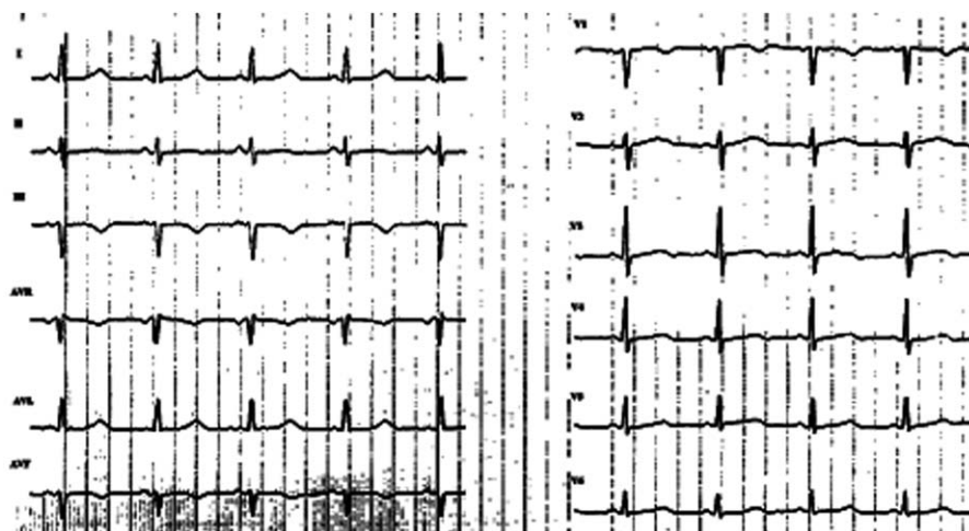
Electrocardiogram showing prolonged QT interval several hours following Torsades de Pointes.